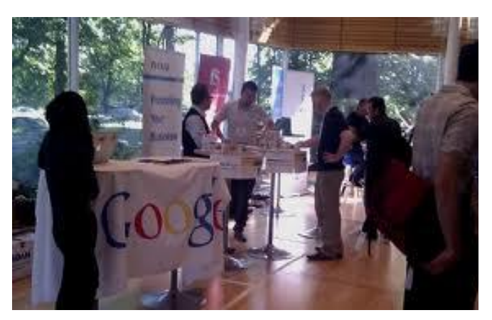
OWASP offers a variety of opportunities for advertising and logo placement at their AppSec conferences

OWASP is providing sponsors exclusive access to its audience in Hamburg through a limited number of Expo floor slots, providing a focused setting for potential customers. Attendees will be pushed through the Expo for breakfast, lunch and coffee breaks giving them direct access to sponsors' booths and technology.