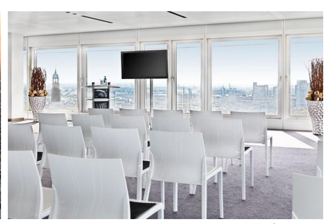
(One of our modern training rooms in the 23^{\text{rd}} floor)