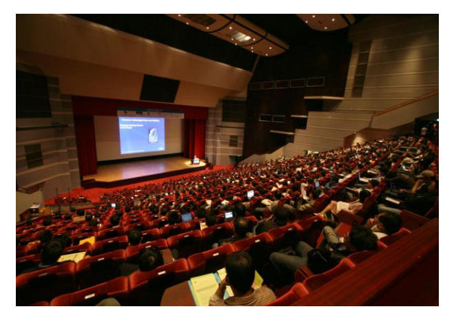
OWASP Global AppSec conferences draw over 2000 global attendees annually

OWASP events attract a worldwide audience interested in "what's next?" — as an OWASP Conference sponsor, your brand will be included as an answer.